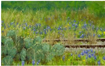
Bluebonnet Railway, 5 x 8 Cynthia Hanks