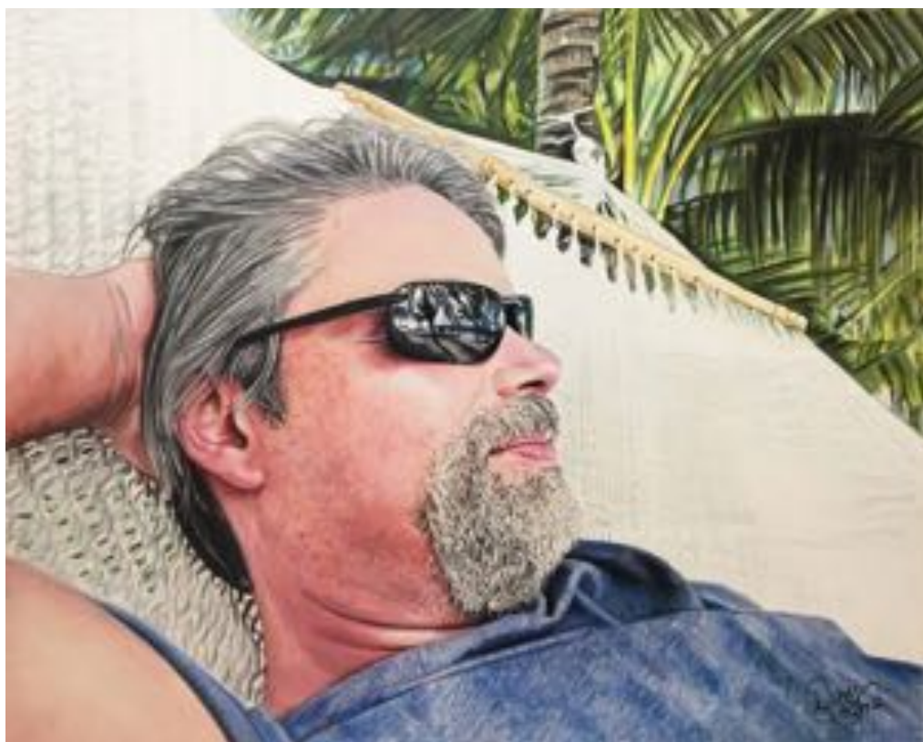
Wait in Belize