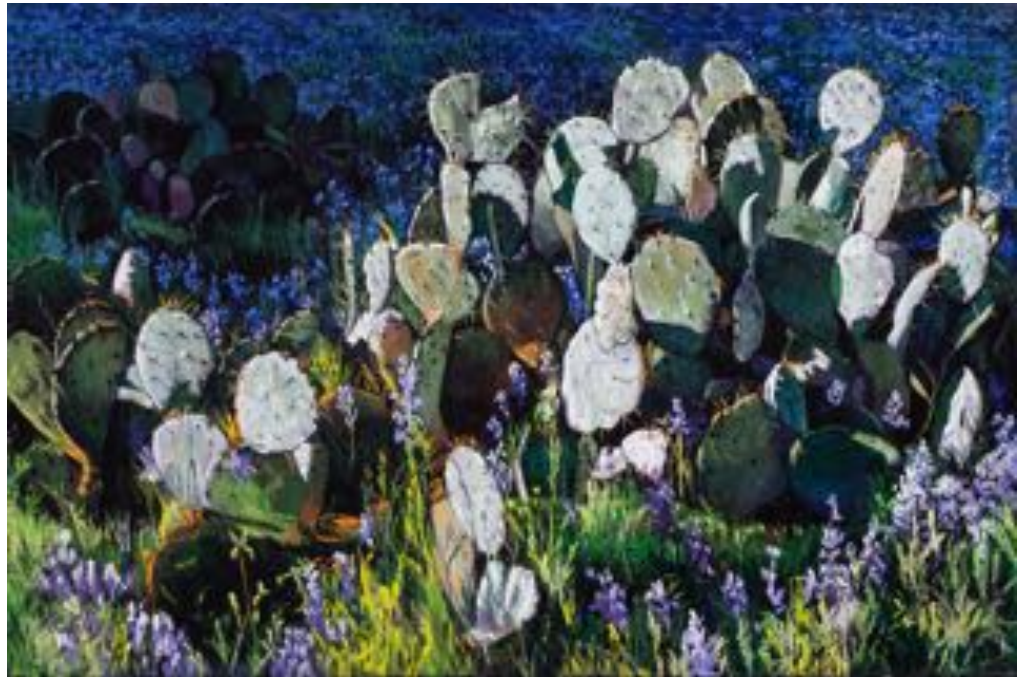
Sunset 20x30 - Nancy Lilly, PSA