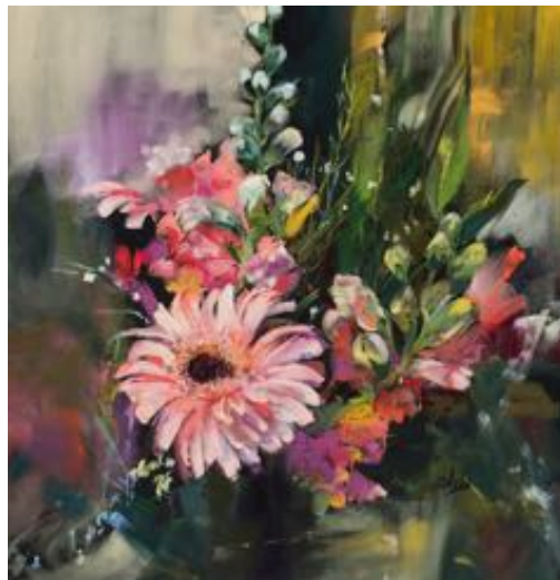
Enid's painting was started in an APS PanPastel demonstration: Snapdragon Bouquet 13 x 12 - Enid Wood, IAPS-MC