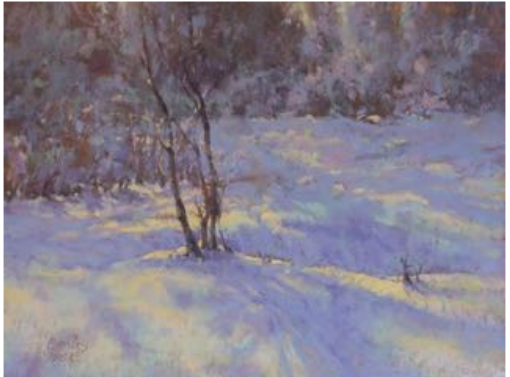
Winter Tapestry, Lynda Conley, PSA, IAPS-MC, PSWC-DP, PSSW