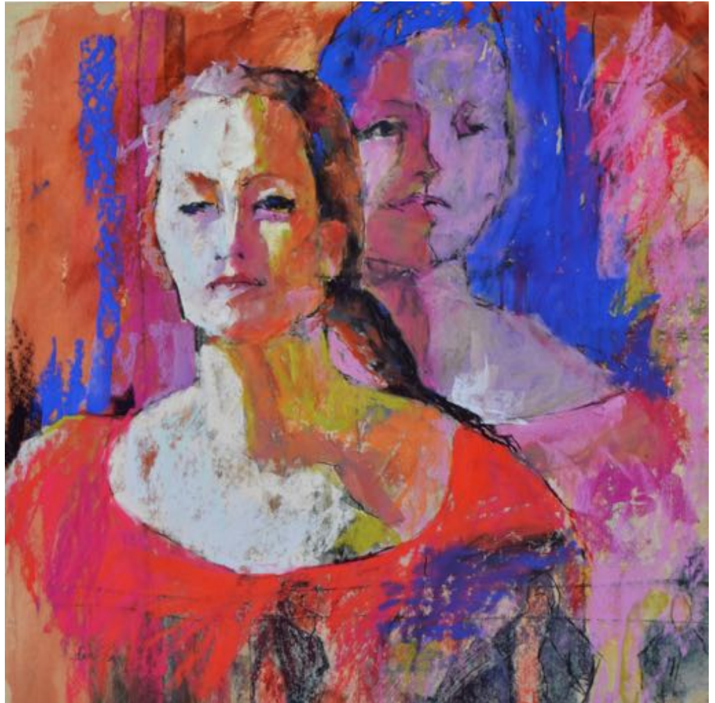
Reflections of My Younger Self, 20 x 20.