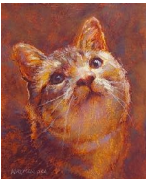
Rita Kirkman, PSA “Purrball” $50 Dakota Gift Certificate