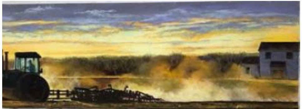
Counting on the Man Upstairs

"When you walk out your door and really look around you, the world is one miraculous creation of light, texture and color. I see beauty everywhere, in the largest of subjects as in the sky, to the smallest of flowers hiding in the grass beneath my feet. My art is my attempt to capture that beauty that is found daily, and my hope is to encourage others to take time and have eyes to see the world around them."